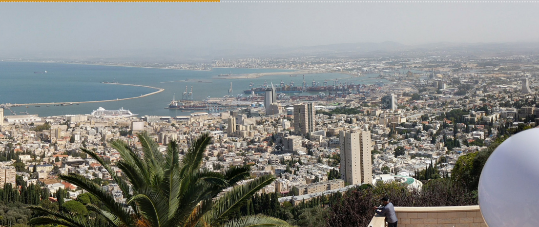
Photo: Haifa – a city where Israelis and Arabs live together in peaceful coexistence.