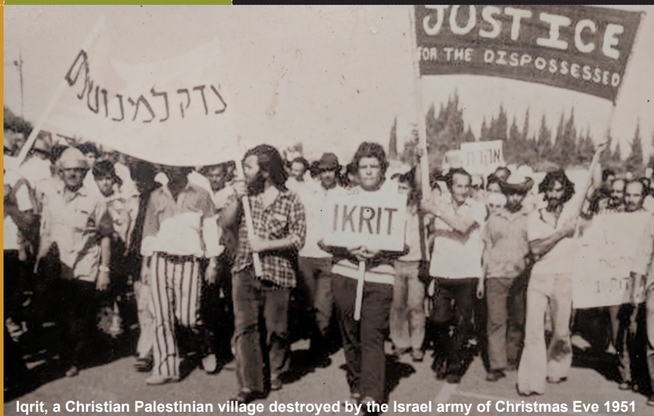
Iqrit, a Christian Palestinian village destroyed by the Israel army of Christmas Eve 1951

describes Israel's 1948 Plan (Plan Dalet), with its mandate to "capture, cleanse, or destroy" Palestinian villages, as ethnic cleansing. Situating his work within a definition that emerged most recently from the events in former Yugoslavia, he describes ethnic cleansing as a well-defined policy of a particular group of persons to systematically eliminate another group from a given territory on the basis of religious, ethnic or national origin. Such a policy involves violence and is very often connected with military operations. It is to be achieved by all possible means, from discrimination to extermination, and entails violations of human rights and international humanitarian law. Most ethnic cleansing methods are grave breaches of the 1949 Geneva Conventions and the 1977 Additional Protocols and have been declared a crime against humanity. Pappe adds the reminder that ethnic cleansing also seeks to wipe out that groups' history. 7