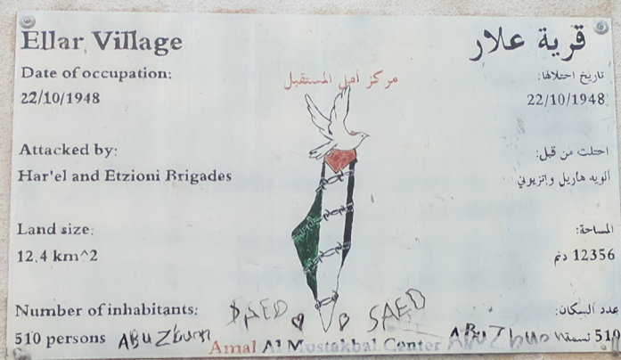
Photo: One of the more than 400 villages destroyed during the Nakba.

of the war effort against the Ottomans, was false, the Palestinians refused to agree to the terms of the UN resolution. In the war that followed, called Nakba by the Palestinians, the Israeli military force, Hagana, but more particularly, extremist groups such as the Stern Gang and Irgun wracked havoc on Palestinian villages. Massacres of whole villages took place.