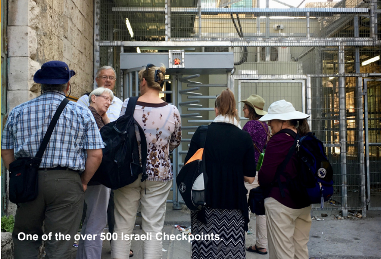
One of the over 500 Israeli Checkpoints

All photos have been provided by the author or The Presbyterian Church in Canada and the Women's Missionary Society. They are from previous participants of study tours to the Middle East.