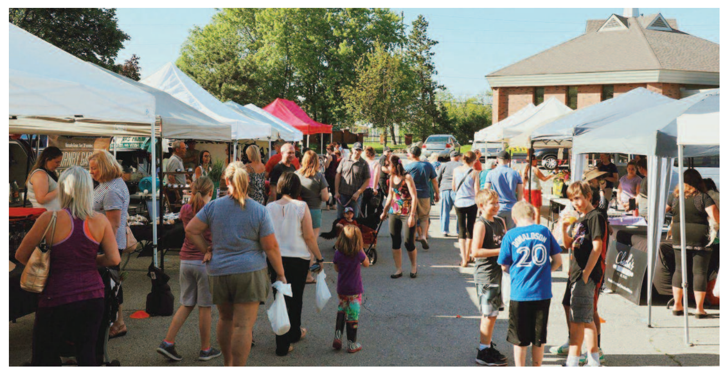
Farmers' Market started by Heritage Green Family Church (Stoney Creek, ON) in partnership with their neighbours.