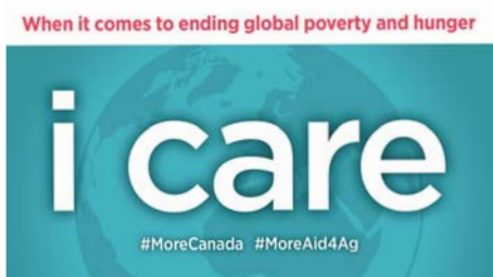
PWS&D shares God's love beyond our borders

As we mark Canada Day, let us also celebrate Canada's contributions around the world. International aid plays an important role in addressing poverty, hunger and inequality in vulnerable countries. Support from the Government of Canada for PWS&D's maternal, newborn and child health program in Afghanistan and Malawi maximizes Presbyterian contributions to projects delivering life-saving healthcare to mothers and babies. Let's continue sharing Canadian compassion and generosity throughout the world. Through the I Care campaign, Canadians can sign a postcard addressed to the prime minister, letting him know that they care about and support Canada's role in ending global hunger and poverty.