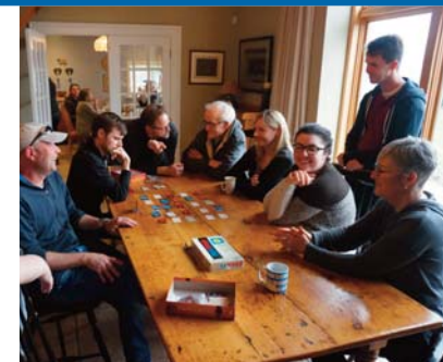
Presbyterians Sharing helps congregations explore new initiatives

With support from Presbyterians Sharing, Two Rivers Church in Guelph, ON is exploring new ways of being the church. A recipient of the PCC's Supporting Ministry Grant, the ministry is made up of "Living Rooms," where people gather together in homes for meals and conversations that draw them deeper into friendship in Christ. They recently began The Prayer Project, which encourages spiritual depth, wisdom and maturity among its members through prayer. The Prayer Project is a multi-faceted approach to forming missional apprentices of Jesus, through a variety of initiatives that include a weekly contemplative prayer walk, a Healing Prayer Team, as well as special events dedicated to communal prayer.