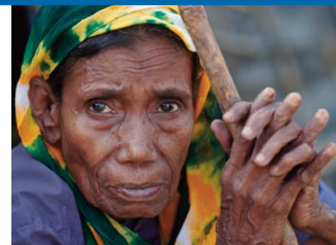
PWS&D promotes sustainable development for peace

The International Day of Prayer for Peace is a time to reflect on the importance of upholding peace among people and across nations. A peaceful society is one where justice, equality and security are available to everyone. To achieve this, people everywhere need to have the opportunity for economic and social development. That is why PWS&D is working in some of the most vulnerable and marginalized countries around the world to help families overcome poverty, hunger and oppression by promoting health, education, gender equality, sanitation, protection of the environment and social justice. While peace will enable a compassionate world to take shape, a sustainable environment will also further peace.