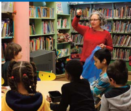
Presbyterians Sharing helps people realize their full potential

For over 90 years, Tyndale St-Georges Community Centre has offered empowering, supportive programs and services to the community of Little Burgundy in south-west Montreal. As one of the few English community centres in the city, Tyndale's programs include early literacy programs for preschoolers, after-school programming and day camps for school-aged children and life-skills training for adults. Located in an area that faces challenges related to poverty and has a high concentration of single-parent families, the centre is committed to ensuring that each member of the community has the opportunity and skills needed to realize their full potential.