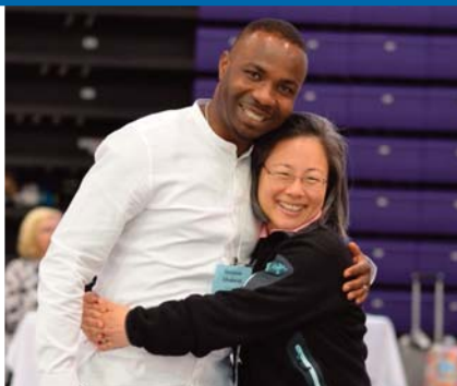
Presbyterians Sharing puts faith into action

New church development. Partnership. International mission staff. Theological colleges. Healing and reconciliation. Leadership development. Congregational support. And so much more! Today is Presbyterians Sharing Sunday, a time to celebrate the impact our church's mission and ministry programs are having across Canada and around the world. As we encourage and equip one another and teach about love, faith and hope, we proclaim the good news of the Gospel.