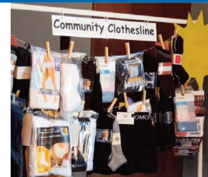
Presbyterians Sharing encourages generosity

Throughout his ministry, Jesus preached on the importance of caring for people living on the margins of society. Responding to a need in their local community, the grant-receiving congregation of St. Matthew's Presbyterian Church in Grand Falls-Windsor, N.L. has constructed a "community clothesline" in their sanctuary. At each of their monthly services, the congregation hangs new adult socks, hats, mitts, scarves and underclothes on the clothesline, which are later distributed by the Salvation Army's Community and Family Services division. At each service, the clothesline cannot hold all of the items due to the generosity of its church members, and extra bins must be set up to collect all of the donations.