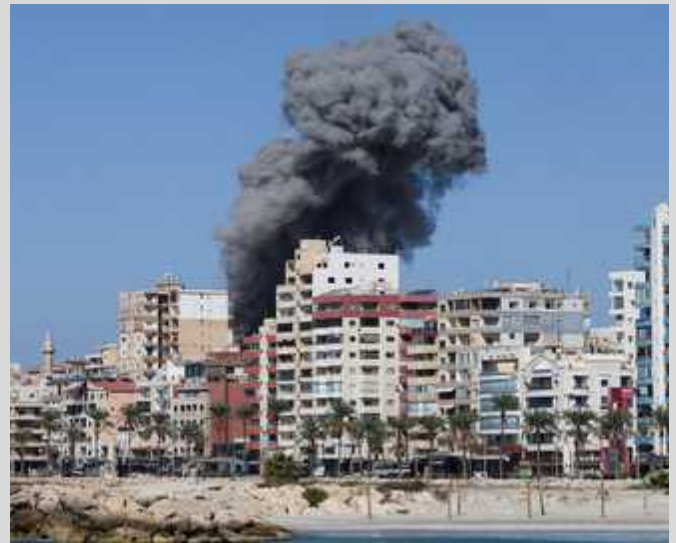
By Kipker, M. (2006). Hours after routing evacuation orders, Israel took aim at Tyre, an ancient port city in Lebanon, in the military's ongoing campaign against Hezbollah (Photograph). The New York Times. https://www.nytimes.com/2006/07/26/international/middleeast/26tyre.html

At the same time, the daily relentless and brutal air attacks that had started a while ago on the southern suburb of Beirut had expanded with incredible military force to different areas of the city. A central part of Beirut which is heavily populated had now been brutally hit and hundreds were killed inside their homes as their buildings crumbled.