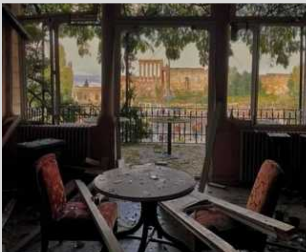
Big Baalbek, 02/04, November 8: From inside the historic Palmyra Hotel in Baalbek (Photograph)

However, as everyone worried and prayed that the air strikes would spare this wonderful site, another famous adjoining site was hit and completely demolished. It is a very old and famous Palmyra hotel. Hundreds of celebrities, actors, and guests stayed there and had their photographs decorating the walls. Many felt very strongly that part of history had been erased forever.