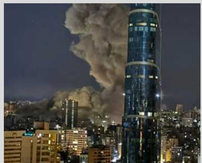
© Justin T. Sizemore (2006). An aerial view of an air attack on Beirut, Lebanon, in the military's ongoing campaign against Hezbollah (Photograph). The New York Times. https://www.nytimes.com/2006/07/26/international/middleeast/26beirut.html