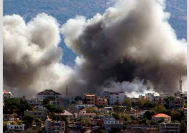
Smoke rises from the site of an Israeli airstrike that targeted the southern Lebanese village of Kham on October 24, 2024, amid the ongoing war between Israel and Hezbollah.

Villages, towns cities, and heritage sites many of which go back to the bronze age and the Roman Empire days were being targeted and systematically demolished.