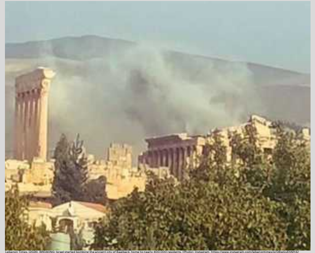
Lebanon Times, 02/01/2024, BREAKING: Israel started bombing the ancient city of Baalbek home to nearly 200,000 residents

As the air strikes came closer to the historic city of Ba'alback, with its famous Roman temple, everybody worried and prayed for its safety. This is a landmark site that can never be fixed or replaced. It is a temple where a stage was set up for very famous classic plays to be performed by famous actors and attended by famous people.