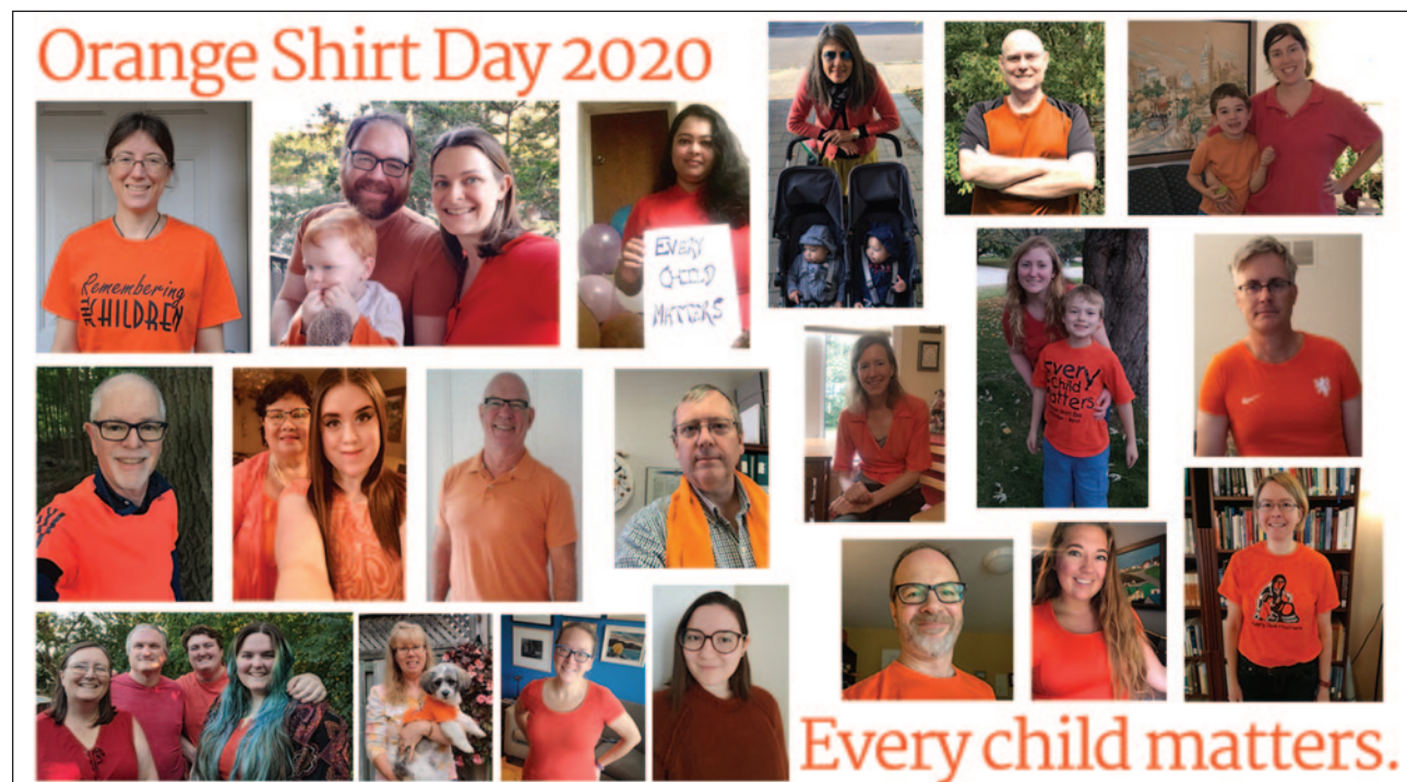
Staff at The Presbyterian Church in Canada national office took part in Orange Shirt Day on Sept. 30, 2020.

Theme Days —Set a theme for some of your online gatherings. For example, hat day (everyone wears a funny hat), worst shirt Wednesday (people wear ugly shirts), a colour day (everyone wears a specific colour). The seasons of the church calendar and other holidays are also wonderful inspiration