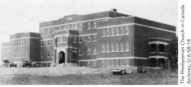
Birtle Residential School, 1931

For more than a century and a half, from the mid-1800s until 1996, Aboriginal children in Canada were separated from their families and communities to attend residential schools in an effort to assimilate them into mainstream culture. The Indian Residential School Settlement Agreement has identified 139 such