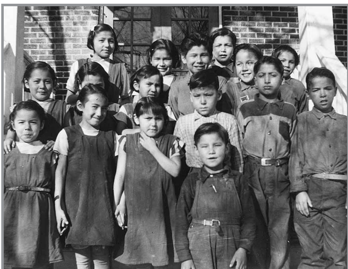
Primary class, Cecilia Jeffrey School, 1953

Pray - Dear God, Thank you for helping us learn about residential schools. Thank you for showing us that there is hope - that you can help us all to heal. We know that you are always here for us, when we feel afraid and sad, and when we are happy and excited. We know that you want us to live together in harmony and that you have shown us the way to do so. Help us share your love with all those around us. Amen.