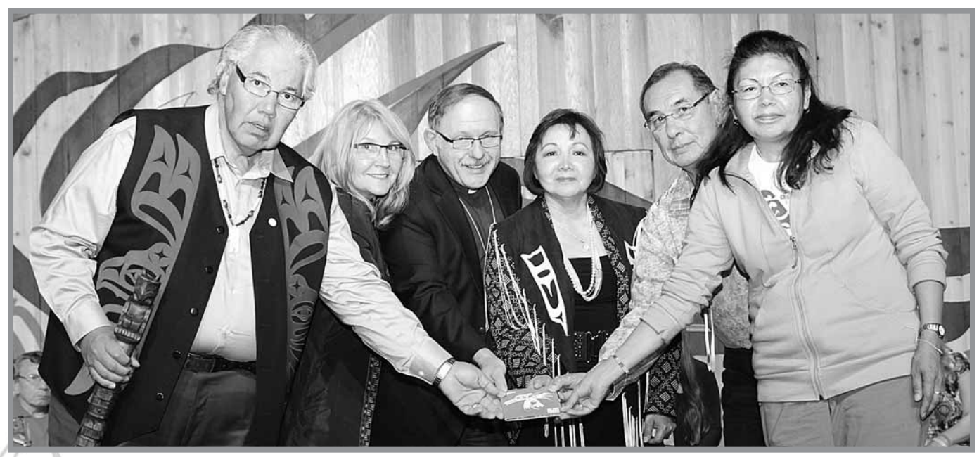
Presbyterian expression of reconciliation, Truth and Reconciliation Commission of Canada national event, Vancouver, BC, 2013