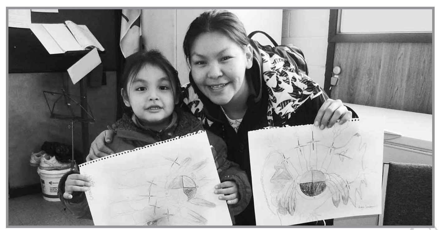
Art class participants at Edmonton Urban Native Ministry