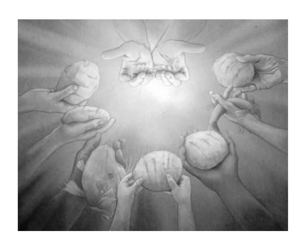
The Theology and Practice of Ministry in The Presbyterian Church in Canada