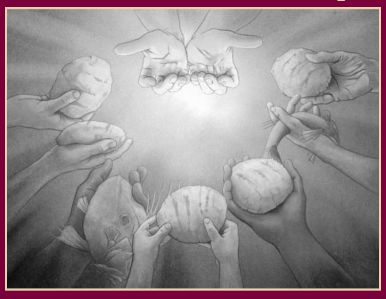
The Theology and Practice of Ministry in The Presbyterian Church in Canada