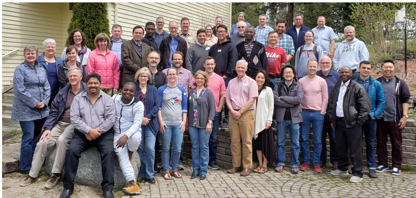
A gathering of people interested in starting new worshipping communities.

The Presbyterian Church in Canada has congregations across Canada with members of many national and racial backgrounds. Currently, Presbyterian congregations worship in Arabic, Cantonese, Cree, English, Efik, Filipino, French, Ga, Hindi, Hungarian, Ibo, Korean, Mandarin, Ojibwe, Portuguese, Punjabi, Spanish, Taiwanese, Twi and Urdu.