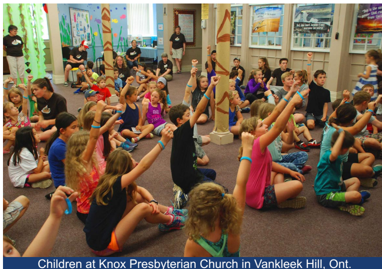
Children at Knox Presbyterian Church in Vankleek Hill, Ont.

The congregation is assessed a financial amount to support the ministries of the presbytery and synod. These assessments