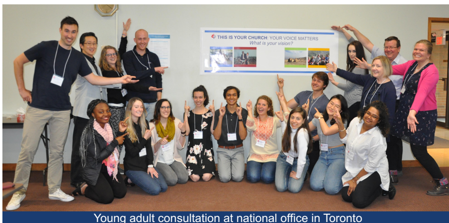
Young adult consultation at national office in Toronto

When a congregation seeks to call a minister, the presbytery appoints a minister to serve the congregation as an interim