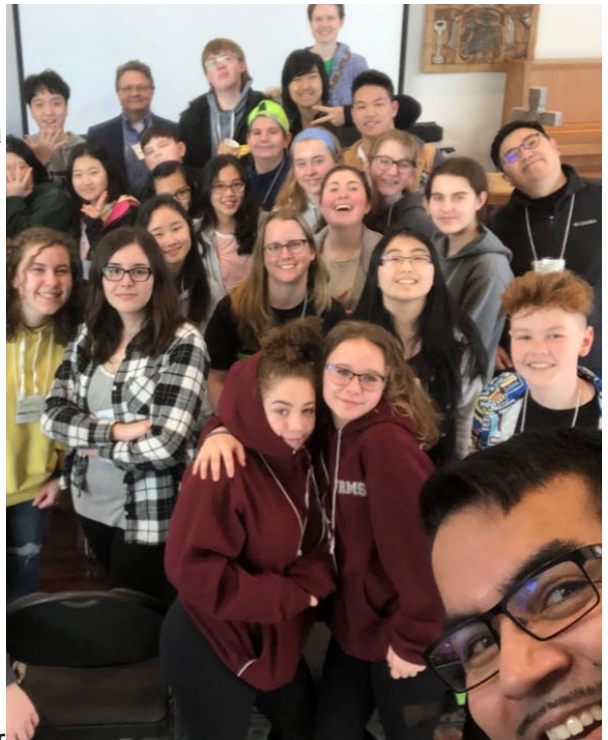
High school students at St. Andrew's Hall in Vancouver learning about discernment and vocation during spring break, 2019.

The minister selected to “preach for the call” will normally meet with various groups in the congregation and preach at a worship service. A congregational meeting is held and a decision made by the professing members in attendance on whether to call the minister. If the vote is in favour of calling the minister, this decision is forwarded to the presbytery. If the presbytery sustains the call, it forwards it to the candidate’s presbytery. The candidate’s presbytery will consider the call. If it also sustains the call, a date can be set for the induction of the minister in the congregation. If the person is not yet ordained, an ordination service will be held first, either separately or at the same service as the induction.