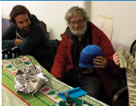
Presbyterians Sharing reaches out to people in need

The cost of living in Saskatchewan is rising, making it even more challenging for those on the margins to make ends meet. Saskatoon Native Circle Ministry understands that, when times are tough, people need spiritual as well as physical care. With support from Presbyterians Sharing , the ministry offers a clothing and food program, a mid-week worship service, an arts program, and crisis and spiritual counseling. Rooted in First Nations' traditions and gospel teachings, SNCM offers prayer, friendship, and radical hospitality to those who are struggling.