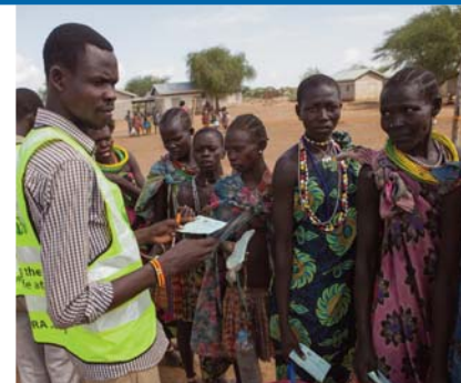
PWS&D responds to bring relief in times of disaster

World Humanitarian Day is held each year on August 19 to honour those working to provide emergency aid and create a more peaceful and humane world. Emergency situations—either natural disasters or conflict—take a massive toll on communities. In war-torn countries, innocent civilians become caught in the crossfire, forced to flee with nothing. Large-scale environmental disasters create massive food shortages, displacement and disease. Dedicated partners at ecumenical networks such as Canadian Foodgrains Bank and the ACT Alliance enable Presbyterian World Service & Development to respond to suffering caused by emergency situations around the world. On this day and every day, we are thankful for the spirit that inspires humanitarian work around the world.