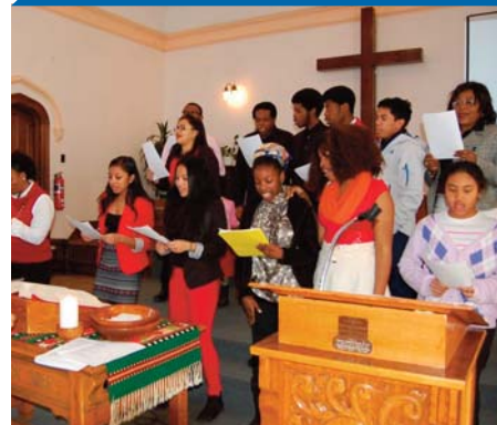
Presbyterians Sharing engages in evangelism, outreach and discipleship

With the support of a coach, provided through gifts to Presbyterians Sharing , Église St-Luc’s leadership team in Montreal is learning ways to evangelize and foster discipleship beyond Sunday mornings. They started with one mid-week Bible sharing group, which quickly grew to three, and now a fourth is in the works. Like Paul and Barnabas in Acts 13, members of Église St-Luc are actively sharing the gospel, and the good news of Christ’s saving power is spreading “like wildfire all through the region” (v.49; The Message ).