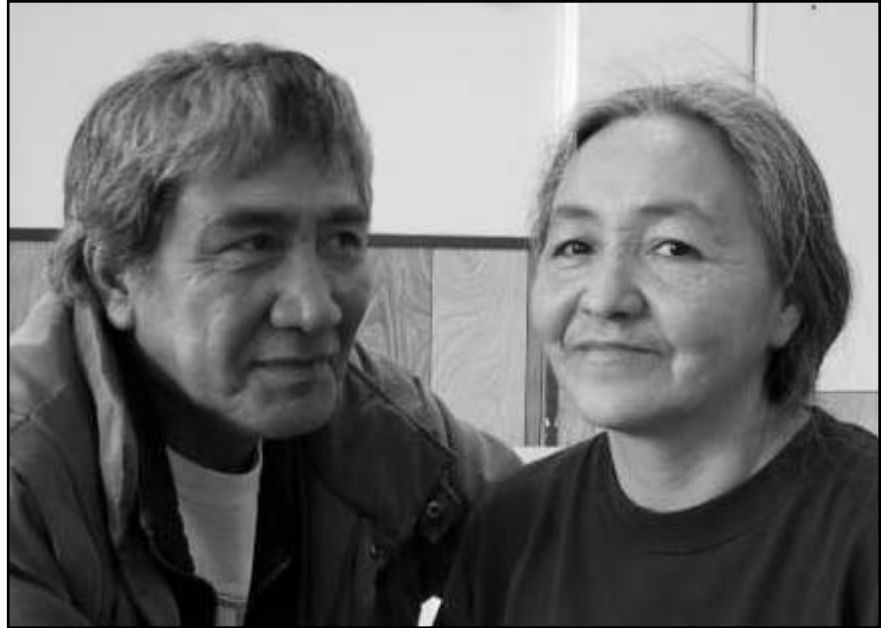
First clients at Edmonton Urban Native Ministries drop-in centre