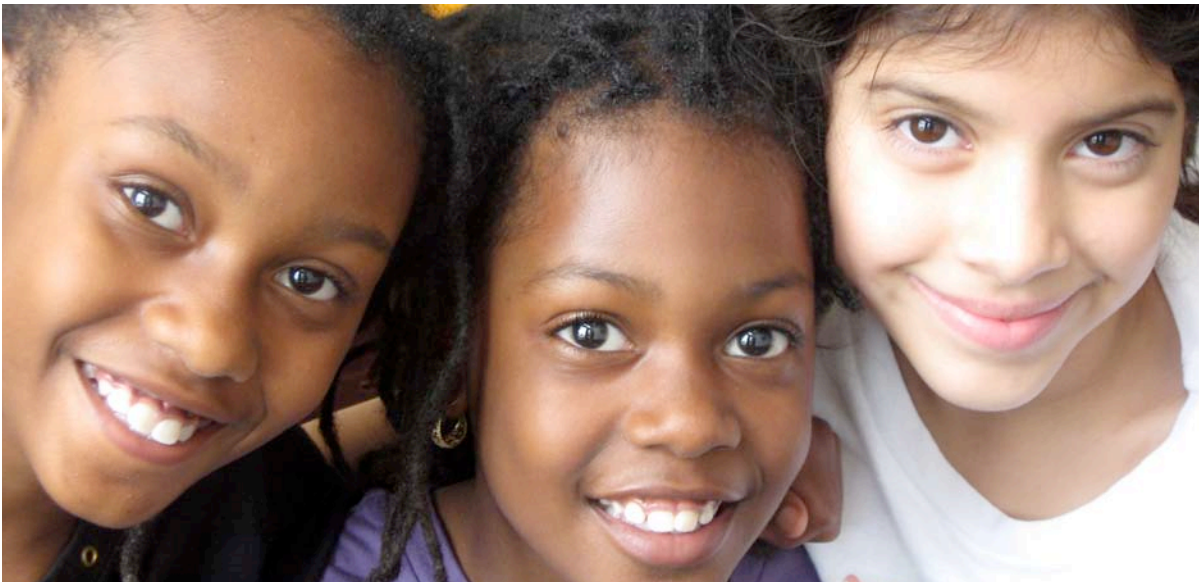
Children participating in programs at University Presbyterian Church in Toronto.

Helping children to understand and participate in stewardship is essential to their faith journey, and is an important element of a congregation's stewardship ministry.